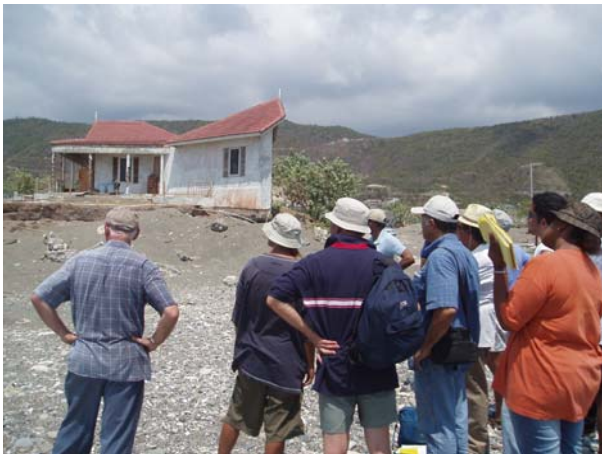
Above: Group observing the damage caused by hurricane Ivan at Copacabana