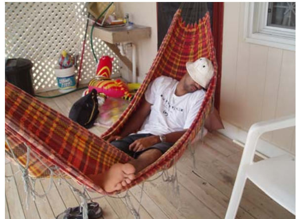
Above: looks like we lost one to the hammock!

The group retired to a time of eating and relaxation as the host served cool drinks to all who asked. Person got an opportunity to interact while others shared their lunches with those who forgot that they might be some distance away from any restaurants to purchase food. Hammock swinging was included in the break I am sure this group will always remember the visit to Andreas' house. After lunch the group reluctantly walked down the beach to observe more beach rock exposed by the hurricane activities.